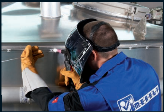
1. Aluminium welding in AC mode