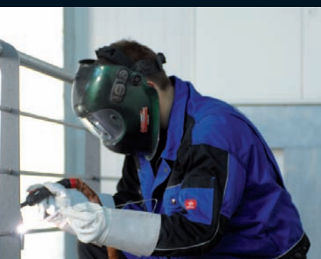
1. stainless welding in DC