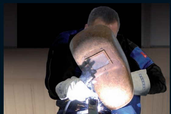
3. MMA / stick electrode welding